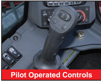
Pilot Operated Controls