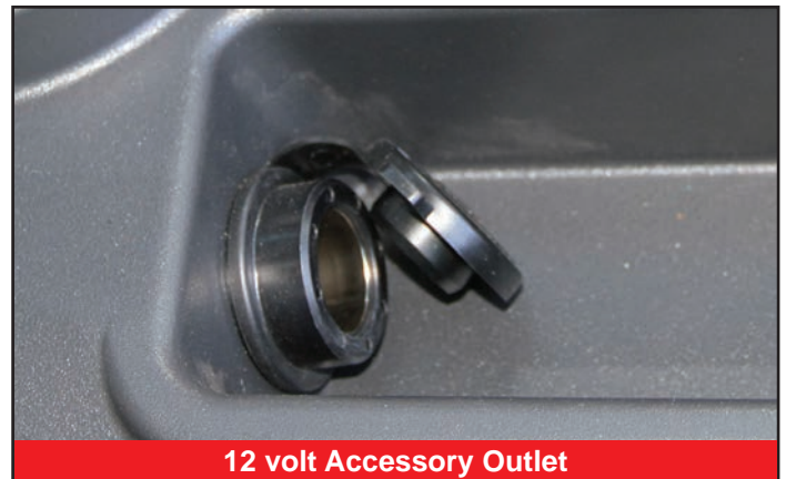
12 volt Accessory Outlet