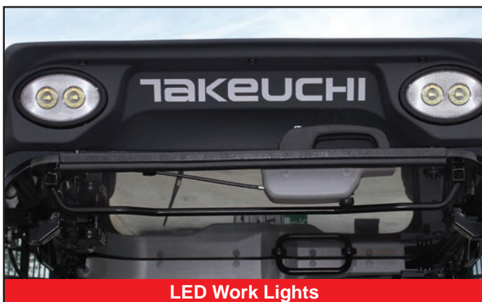
LED Work Lights