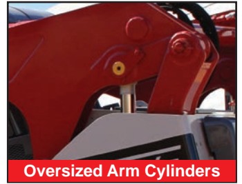
Oversized Arm Cylinders

Takeuchi's first vertical lift compact track loader, the TL12V-2 demonstrates a continuous commitment to product improvement and innovation. It is the largest and most capable track loader available today and delivers best in class rated operating capacity (ROC), a completely redesigned operator's station that features a color multi-information display with rear view camera, convenient rocker switches to control a wide range of functions, and an updated undercarriage design that enhances operator comfort by reducing vibration and noise levels.