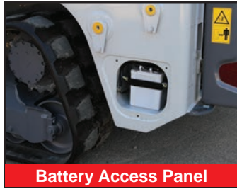
Battery Access Panel