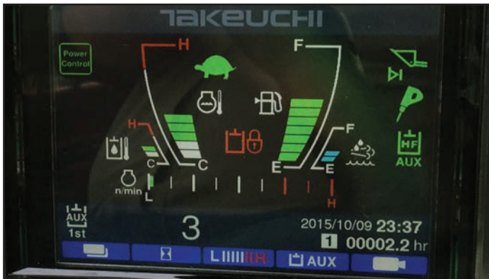
5.7" Color Display with Rear View Camera