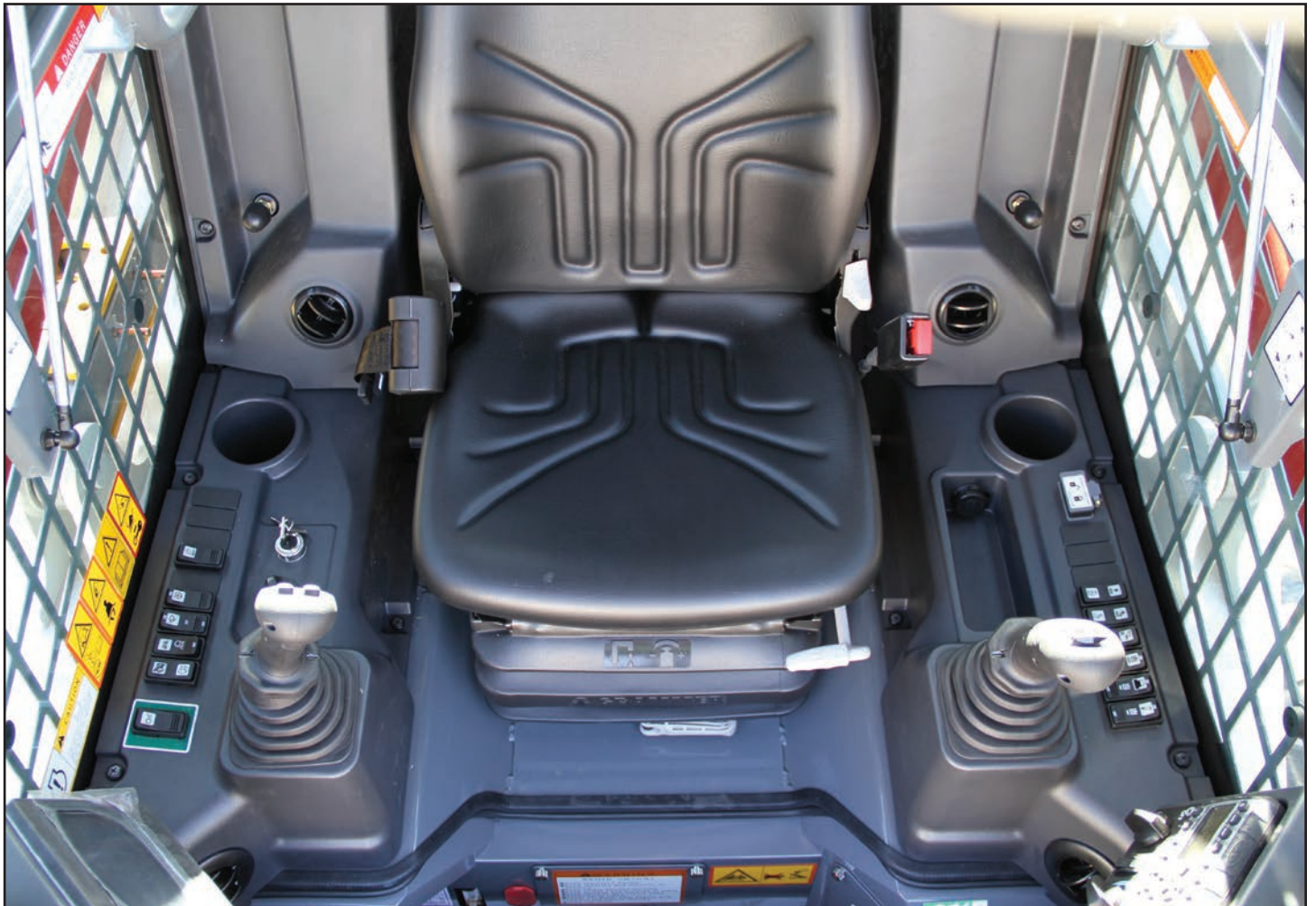
Spacious Operator's Station with Easy to Reach Controls and Switches

Performance features include massive loader arms, oversized arm cylinders and pins, rear bumper with integrated tie downs, high capacity cooling module, and LED lights on the front and rear of the machine. The TL12V-2's interior includes an updated overhead door design, redesigned foot throttle, precision pilot controls, backlit rocker switches, convenient cup holders, and a deluxe high back suspension seat for those long hours on the jobsite.