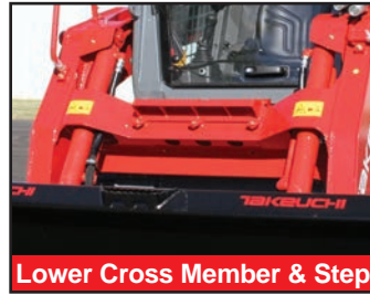
Lower Cross Member & Step