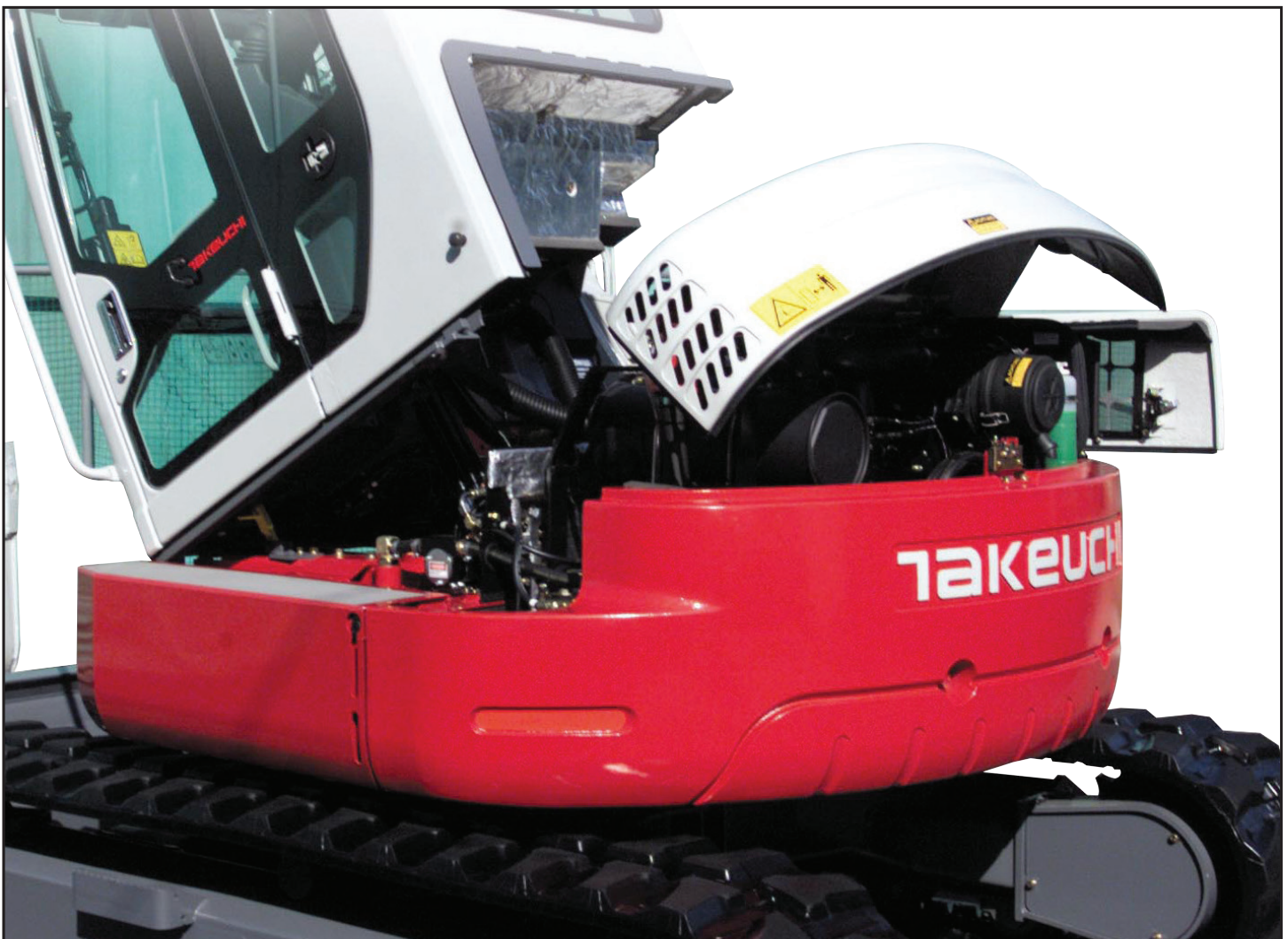
A tilt-able cabin and large lockable service hoods provide outstanding maintenance access.

Serviceability on the TB153FR is simple with the tilt-up cab that provides access to the engine and hydraulic components. Rear access to the machine allows convenient access to daily checks and routine maintenance points.