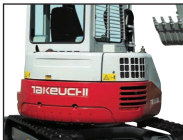
Full Rotation Capability