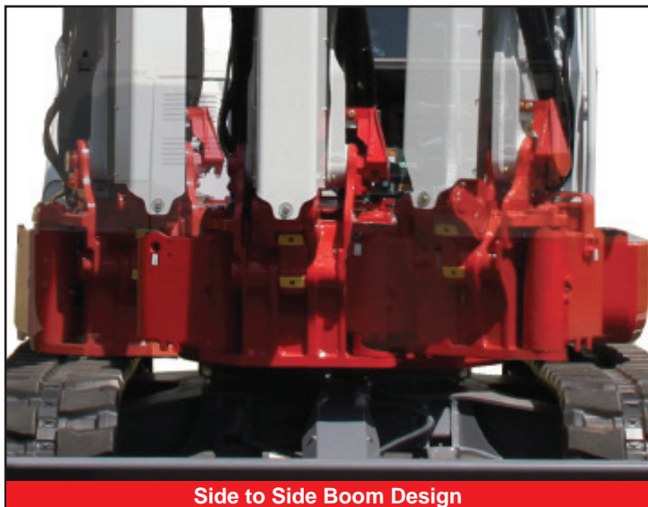
Side to Side Boom Design