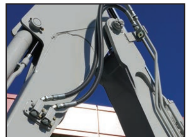
Auxiliary Hydraulic Lines