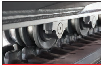
Triple Flanged Track Rollers