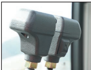
2 Speed Travel w/ Auto Shift