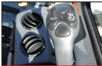
Hydraulic Pilot Joysticks