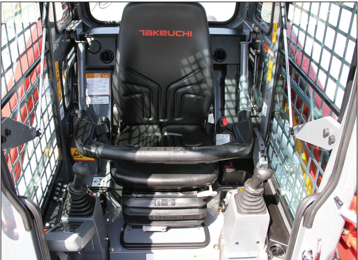
Spacious operator's station with easy to reach controls and switches.

The TL8 offers a heavy duty rear door that swings out providing access to the high capacity cooling module while the tilt back cab / canopy provide access to the clustered engine oil filter, primary, and secondary fuel filters, pump group, control valve, and pilot line filter. Takeuchi quality and functionality ensures the TL8 will deliver many years of trouble free service in the most extreme conditions.