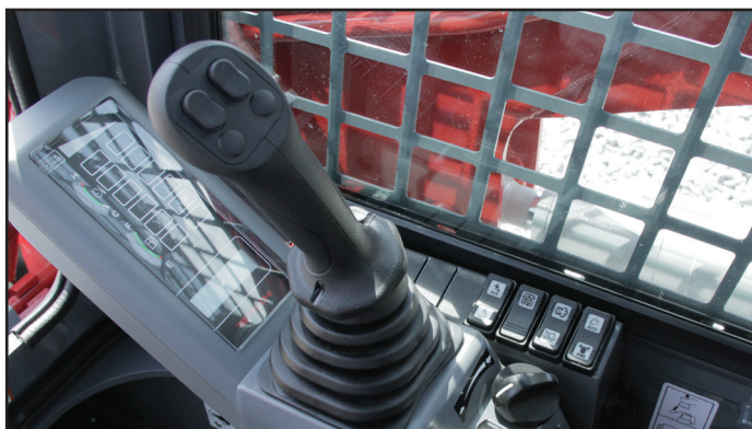
Hydraulic Joystick Controls