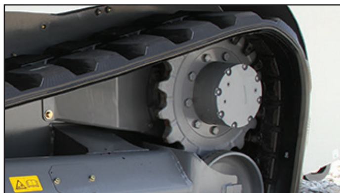
Double Reduction Planetary Track Drives