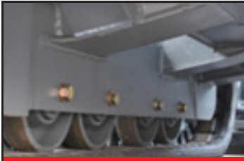
Fully Welded Frame