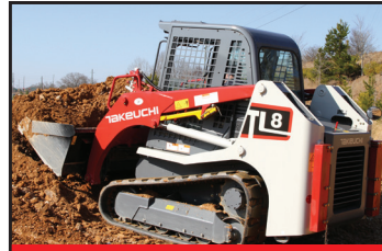
Active Power Control