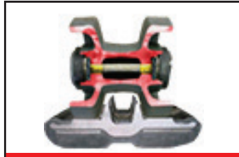
Steel on Steel