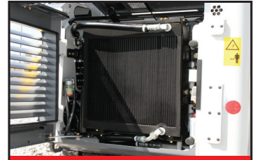
HD Cooling Module

Powerful and efficient, the TL8 is engineered to provide excellent maneuverability, performance, and value. The heavy duty cross member, two-speed travel, and hydraulic self-leveling are standard equipment on the TL8. Operator controls include a multi-function display, hydraulic joystick controls, foot throttle, and a high back suspension seat. The TL8 provides ample space and comfort for your time on the job.