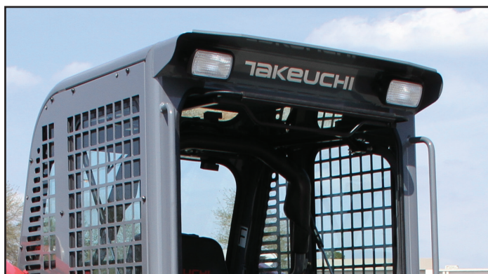
Roll Up Door