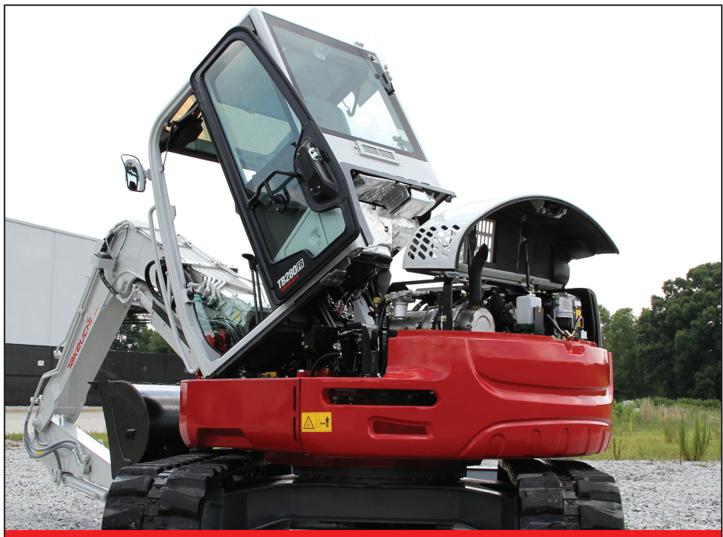
A tilt-able cabin and large lockable service hoods provide outstanding maintenance access.

as a smaller 5 ton machine for greater performance and productivity. Additional features include an updated cabin with automotive styled interior, color multi-informational display, multiple attachment presets with operator adjustable flow rates, standard auxiliary hydraulic circuits 1 & 2 allowing the operator to run a wide range of attachments, backfill blade and a tilt-up cab for greater serviceability.